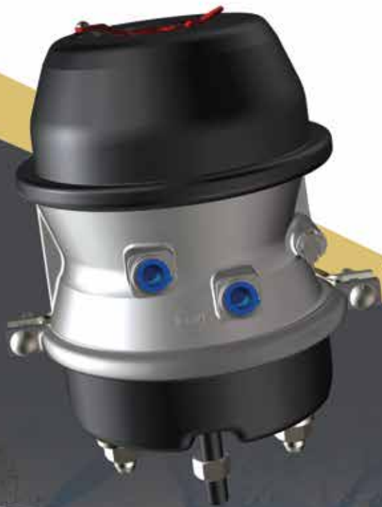
TR-LP3THD Model Shown

PROVIDES EXTRA PARKING FORCE WHEN YOU NEED IT MOST